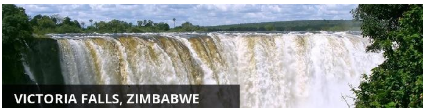
VICTORIA FALLS, ZIMBABWE